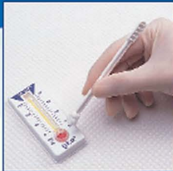
2. Insert collector into test.