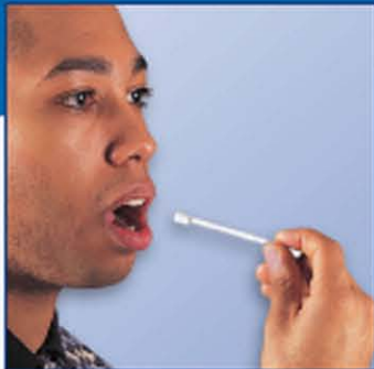
1. Swab mouth to collect saliva.