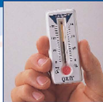
3. Read color bar.