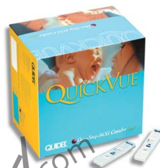
50 Test Combo Kit