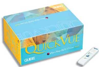
25 Test Urine Kit