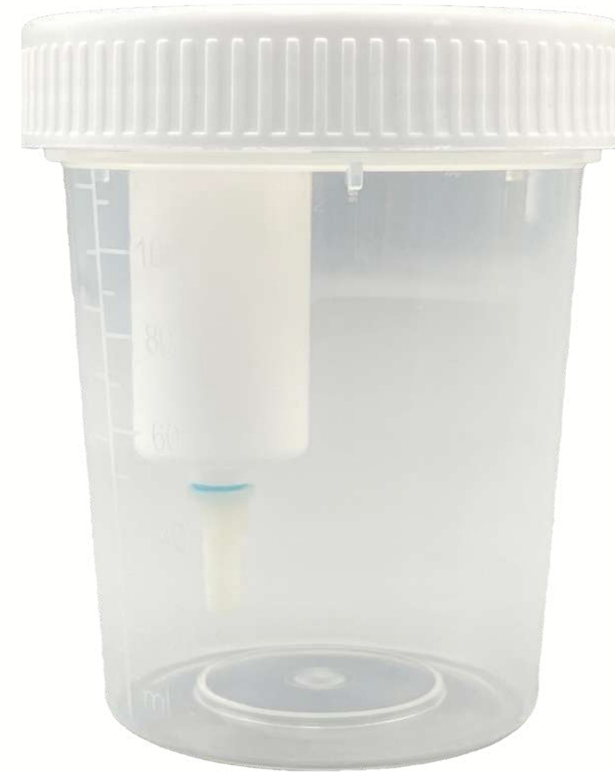
● Collection Cup / 4oz