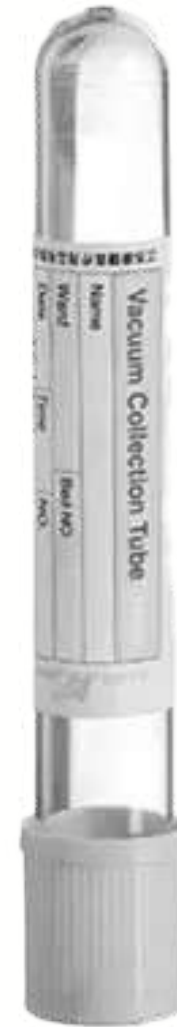
● Plain tube, 5/10ml

Available in different color caps for option