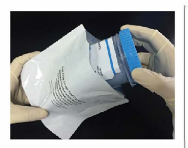
1. Remove the cup from the foil pouch.