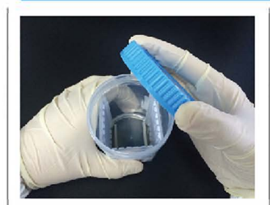
3. Collect specimen in the cup.