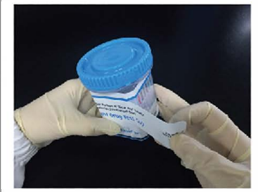
4. At 5 minutes, peel the label and read results. Do not read after 60 minutes.