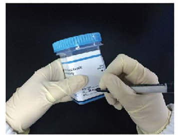
2. Write donor ID and date on the label.