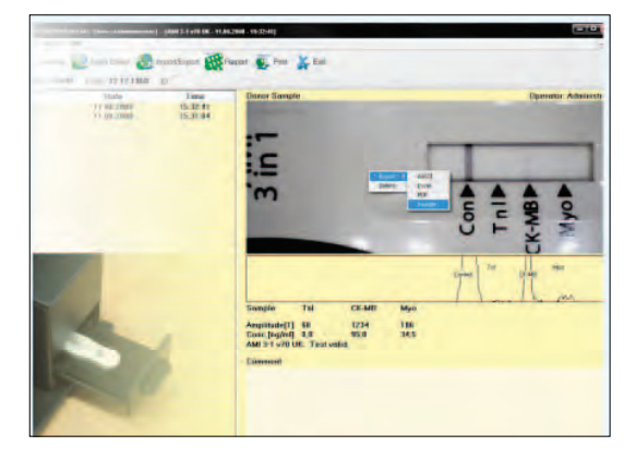
Quantitative results by Nano-Checker 710 are automatically determined and displayed or printed as PDF format report.

Intuitive results display - visual signal indicates positive; any faint signal on test line, and negative; no signal.