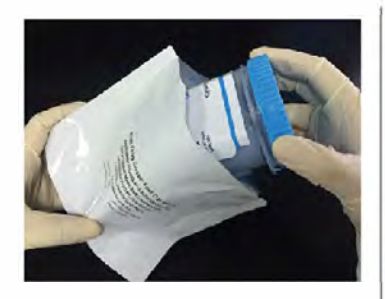
1. Remove the cup from the foil pouch.