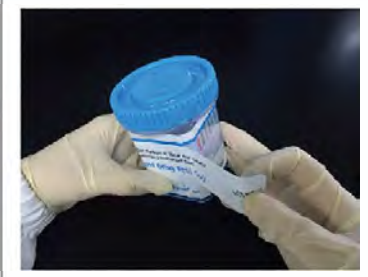
4. At 5 minutes, peel the label and read results. Do not read after 60 minutes.