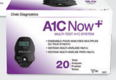
A1CNow<sup>+®</sup> system (20-count test kit) CHEK-3021